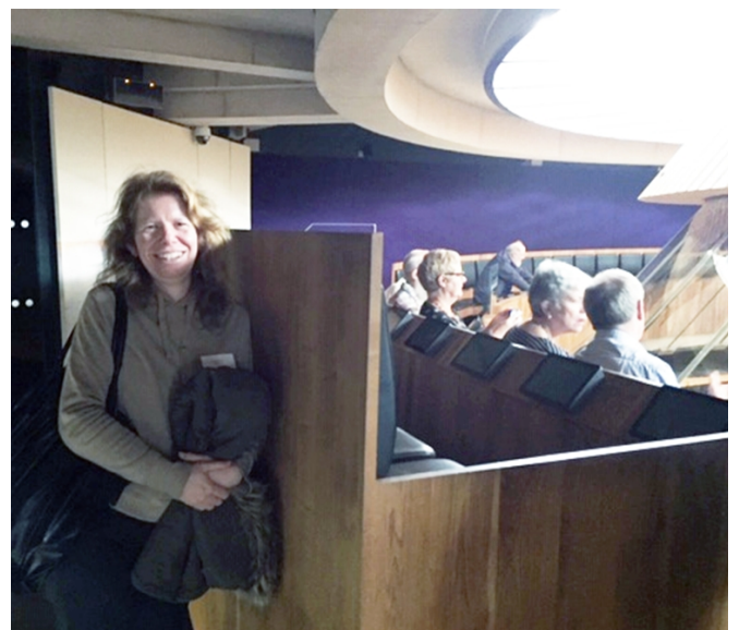
Inside the chamber at the Senedd

Our walk took in the line of the Glamorganshire Canal coming down into the Bay area, preserved in part as a linear park, and then it was around the corner into West Bute Street and an amazing accumulation of substantial buildings intimately associated with the coal and shipping companies, banks etc, all vying via their signature HQ buildings to send out a message of dynamism and success.