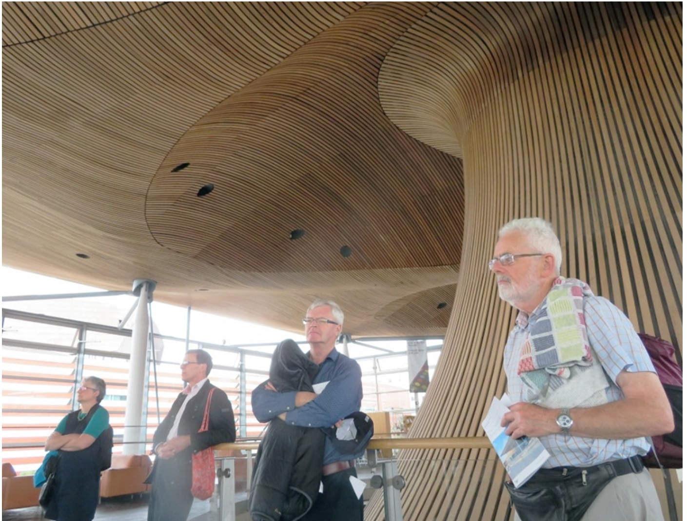
The striking interior ground floor of the Senedd

Their physical scale and number was almost breathtaking, especially as most seemed rundown or even unused. The National Provincial Bank of 1926-7, seven bays wide and five storeys high was a typical (and late) example. And in the middle of it all and completely filling the former Mount Stuart Square stood the Coal and Shipping Exchange of 1884-8 and later, now the Exchange Hotel and our venue for dinner.