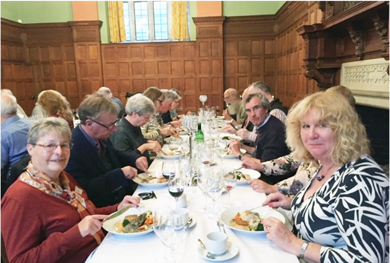
Some of the members enjoying one of our favourite activities!