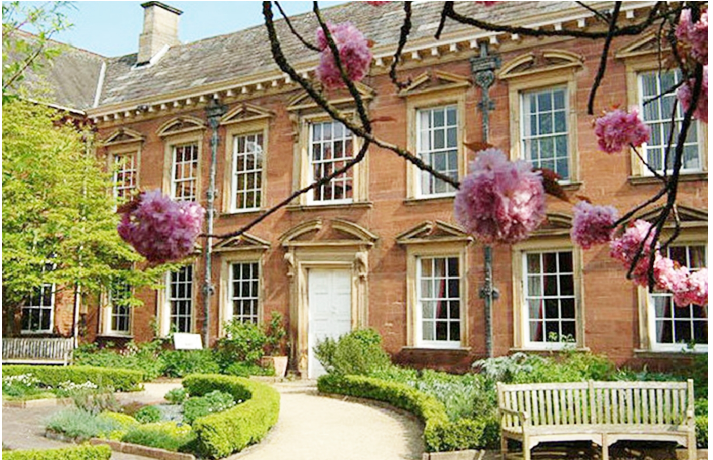
Tullie House, Carlisle